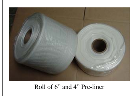
Roll of 6" and 4" Pre-liner

doesn't make it, you're only out the cost of the pre-liner rather than tube, resin, and cal-tube. Additionally, rather than face a failure, you can explore other repair or replacement methods, make a customer happy and have a profitable job.